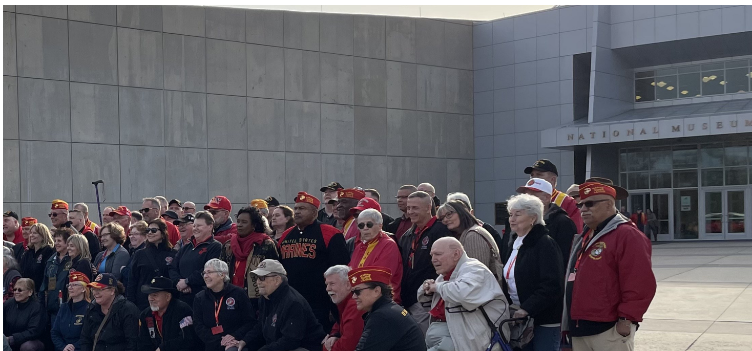
Photo of group at National Museum of the Marine Corps.